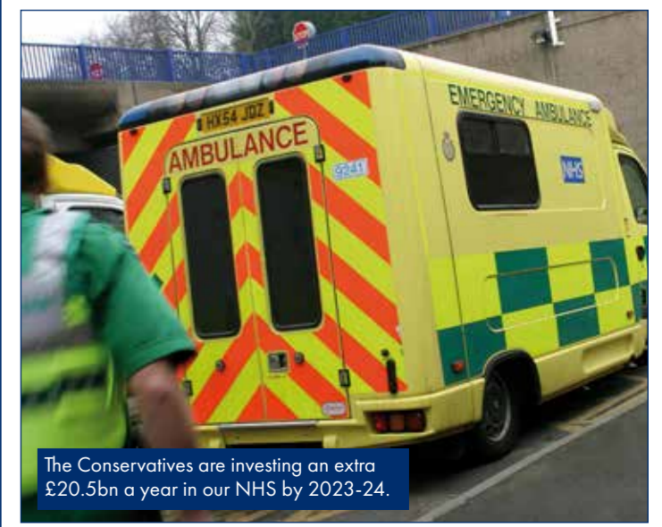
The Conservatives are investing an extra £20.5bn a year in our NHS by 2023-24.

The plan will ensure the NHS provides the best maternity care in the world, supports ageing and increasing independence, improves outcome for all major conditions, increases the workforce and brings the NHS into the digital age.