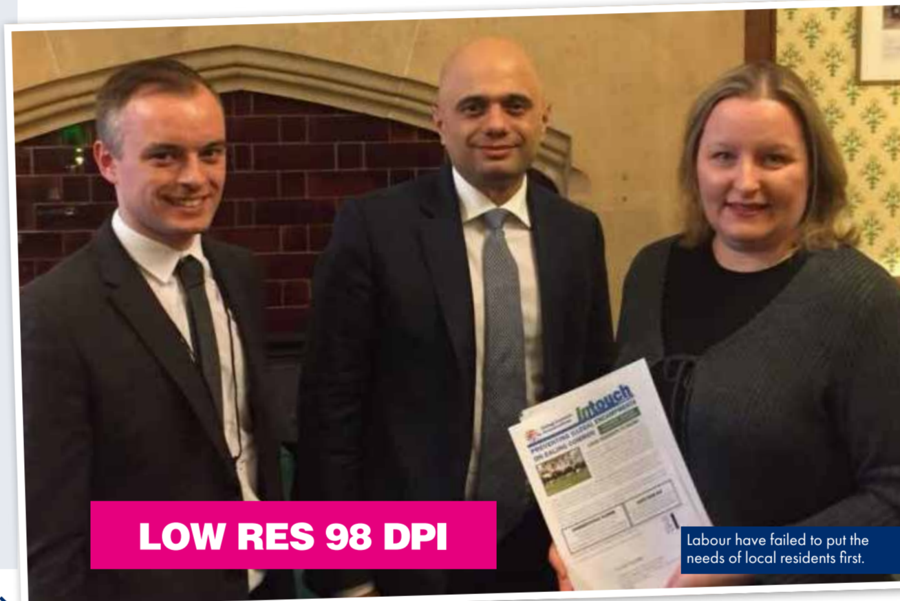
LOW RES 98 DPI

Labour once again put their political agenda above the needs of residents, using their massive majority on the Council to ignore residents' concerns.