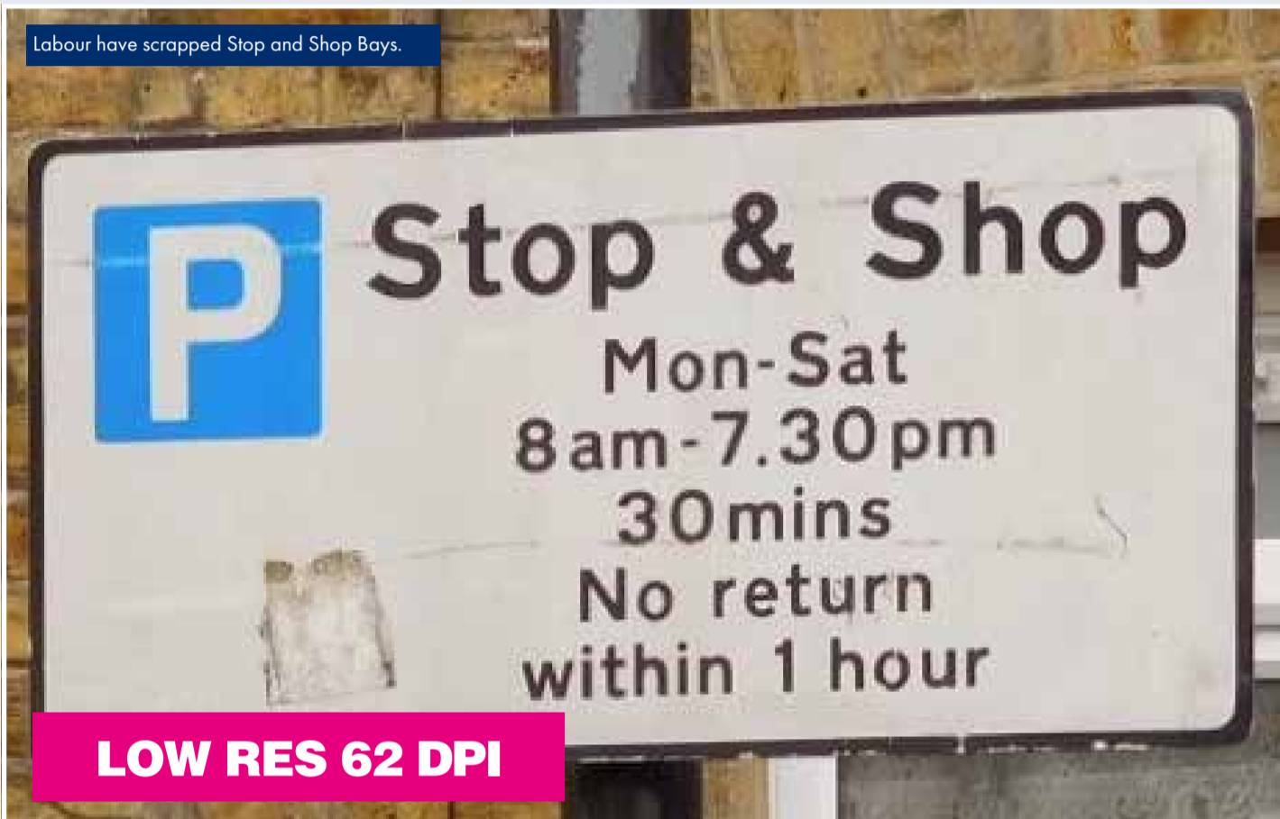
Labour have scrapped Stop and Shop Bays.