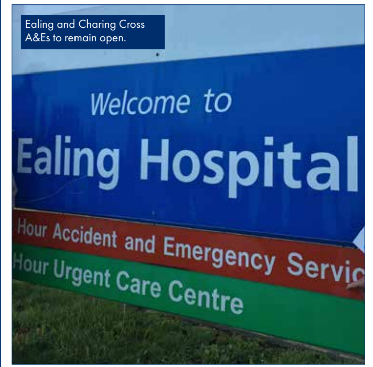
Labour have failed to put the needs of local residents first.