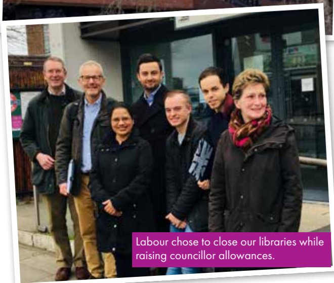
Labour chose to close our libraries while raising councillor allowances.